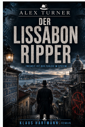
Der Lissabon Ripper